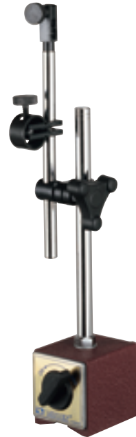
ORDER NO. VMB-B MAGNETIC BASE /80kgs