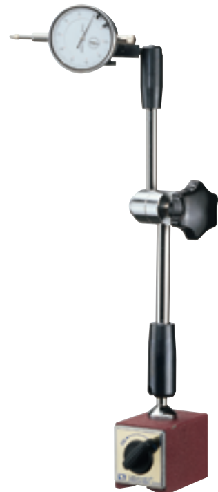
ORDER NO. VMB-70 DELUXE UNIVERSAL MAGNETIC BASE /100kgs