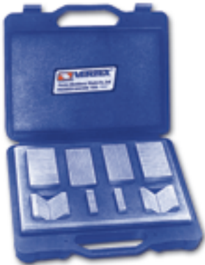
WEIGHT : 8 kg

Comprises a selected set of 4 pairs of blocks