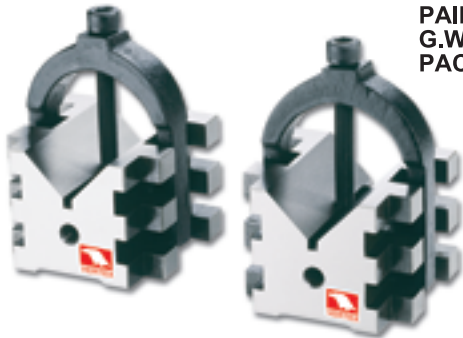
PAIRS G.W. 2.3kgs PACKING:110x80x110mm