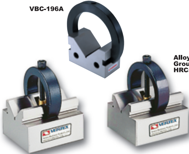
Alloysteel Grounded HRC50