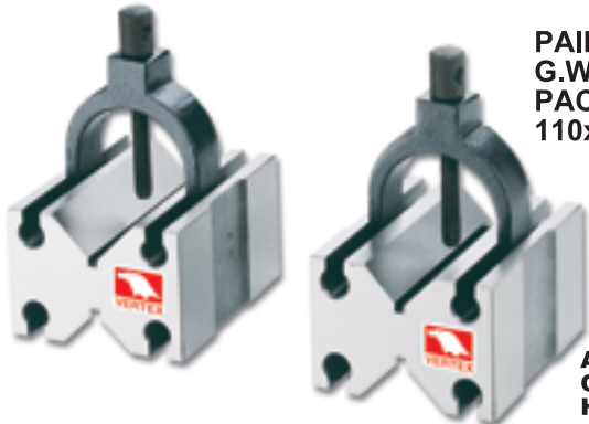
PAIRS G.W. 2.4kgs PACKING: 110x80x110mm