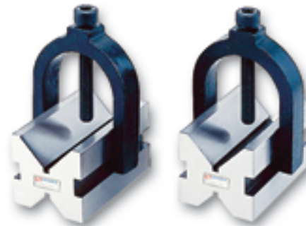
PAIRS G.W. 1.8kgs PACKING: 75x80x100mm