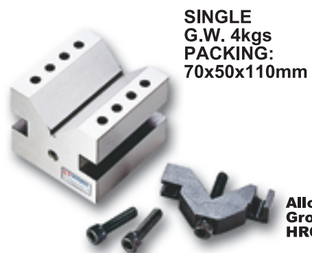
SINGLE G.W. 4kgs PACKING: 70x50x110mm