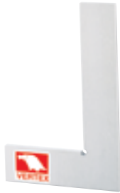
Alloysteel Grounded HRC50